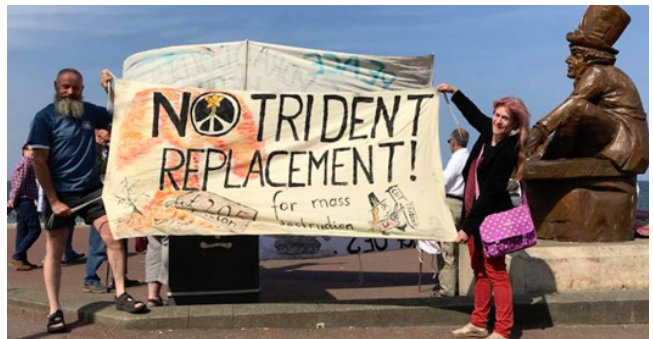
Llandudno says No to Trident, while the Mad Hatter looks on.