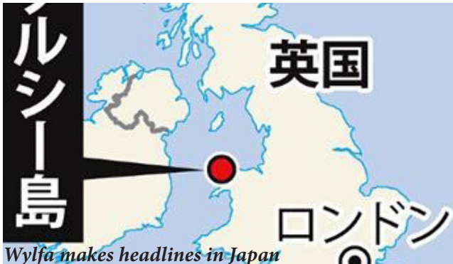
Wylfa makes headlines in Japan