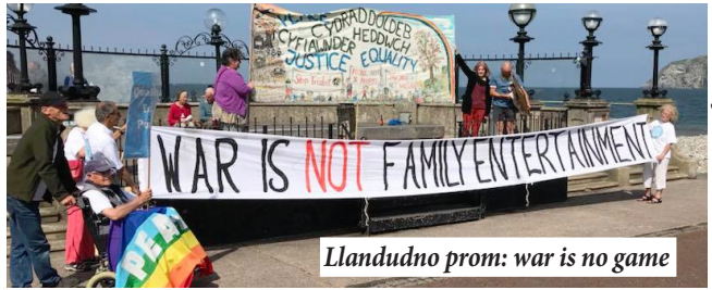
Llandudno prom: war is no game